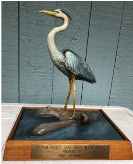
Fig 14: Great Blue Heron Award, PCLT 2003