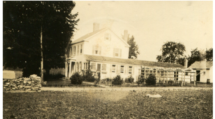
Fig 3: Sterling Farm--Couch Rd #180, 1921