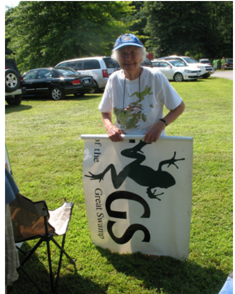
Fig 16: Tabling for FrOGS at Harney Tea Event 2015